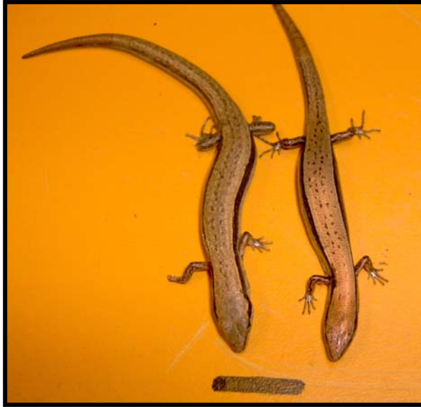
FIGURE 1. Scincella lateralis from Cherokee County, Oklahoma, USA. Both the male on the left and the female on the right have a SVL of 44 mm. Note the difference in head size. The scale bar is 10 mm.

However, at least one other skink species, Mabuya multifasciata , shows sexual differences in the slopes for head length but no sexual differences in the slopes for head width (Ji et al. 2006). This suggests that relationships identified for one head size parameter cannot be assumed to apply for all parameters and so an effort should be made to analyze as many parameters as possible in any study of sexual dimorphism in head size.