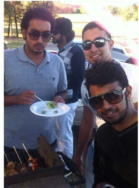
Above: Eid Al-Adha celebration at Lake Tenkiller. The Saudi Student Club celebrated their holiday with other international students.

effort between International Programs, the Baptist Collegiate Ministry, along with the International Riverhawks Club and the Saudi Student Club.