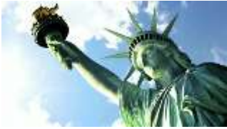
International Trivia Answer: USA