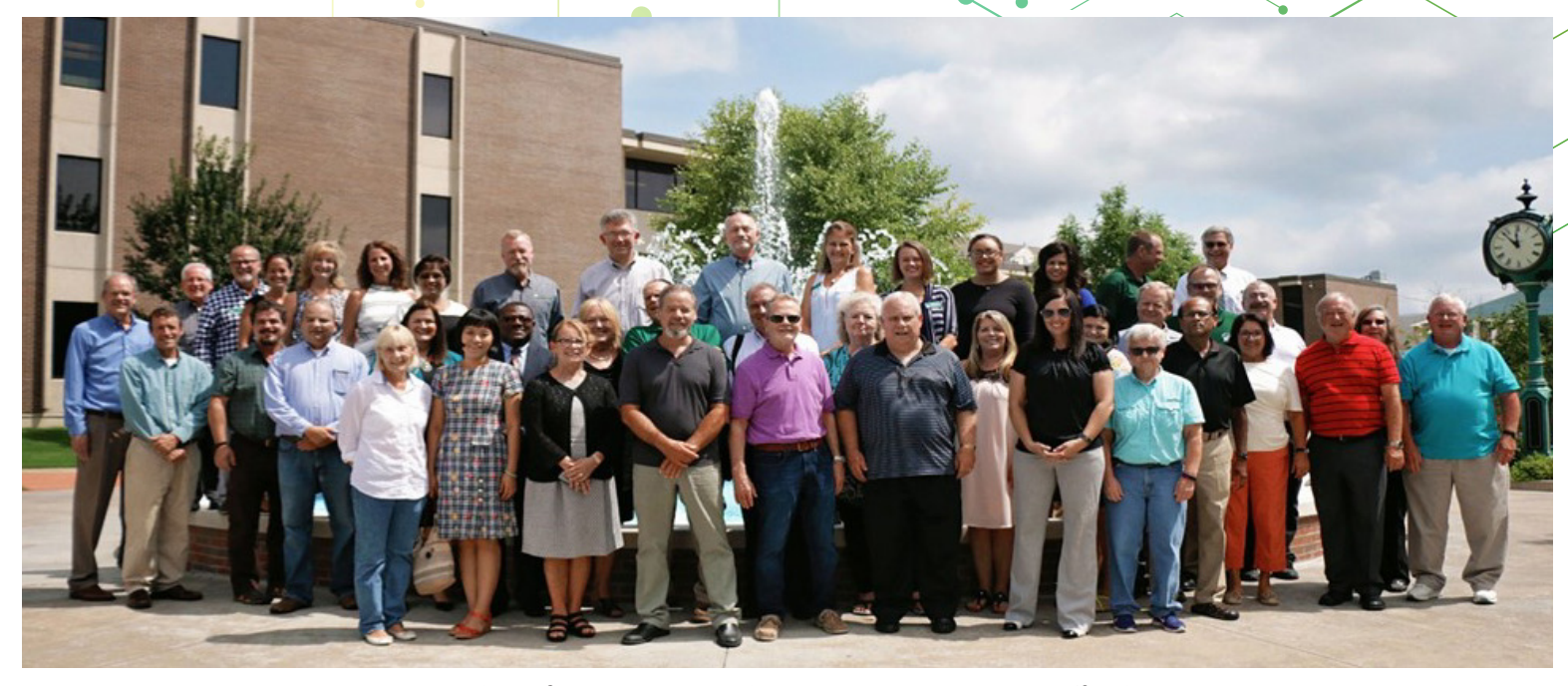
NSU College of Business & Technology Newsletter Faculty and Staff Fall 2017