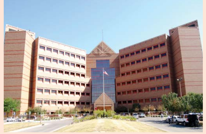
United States Army Brook Army Medcal Center located at Fort Sam Houston, San Antonio TX. JCAHO Accredited Facility

After graduation, you'll enter active duty in your •Be a US Citizen specialty and advance in rank to captain. With every promotion, your salary will increase. Your time-in-service and cost-of-living adjustments also lead to pay increases. Additionally, you'll receive a monthly non-taxable allowance for food and housing.