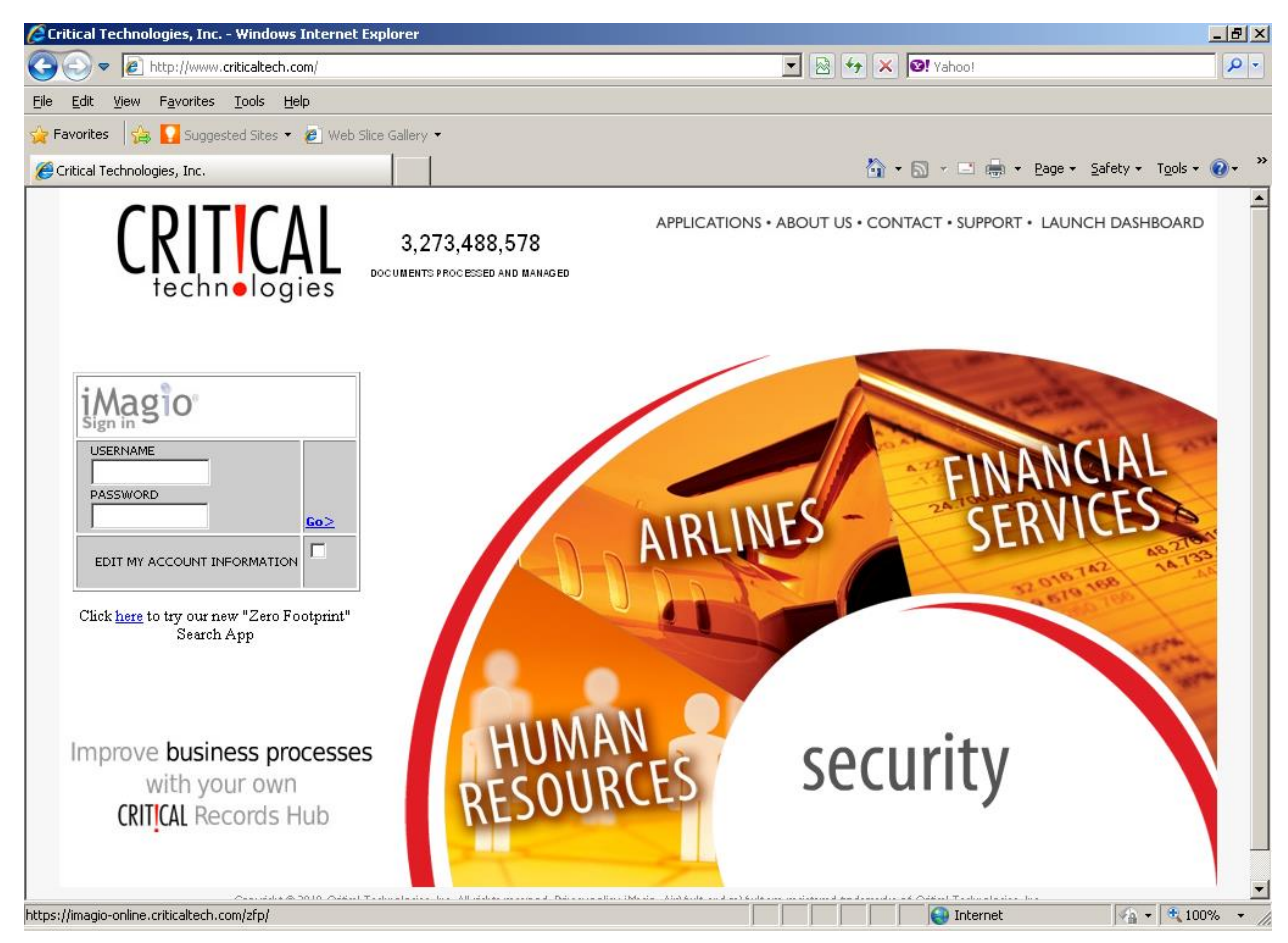
click on the "Click here to try our new "Zero Footprint" Search App