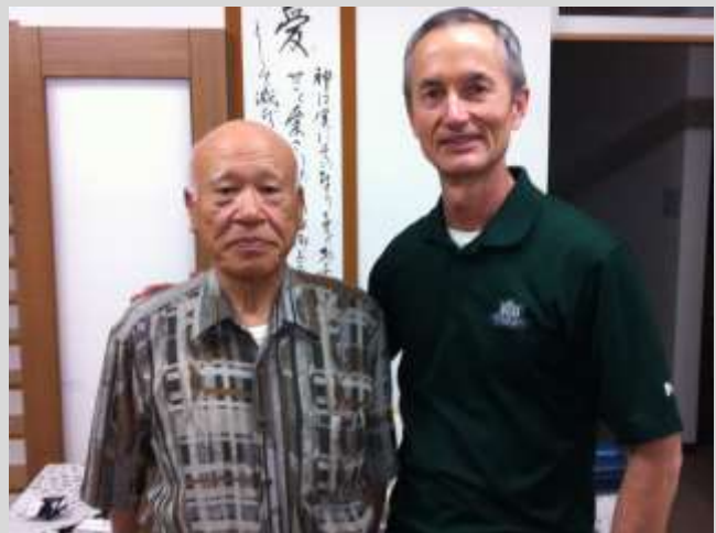
Meeting with a tsunami survivor whom I met in 2011 during tsunami recovery work.