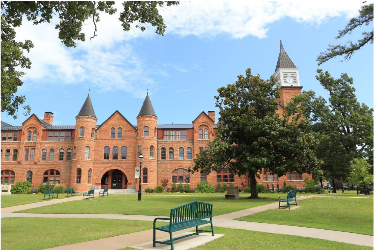
Seminary Hall is the historic centerpiece of Northeastern State University.