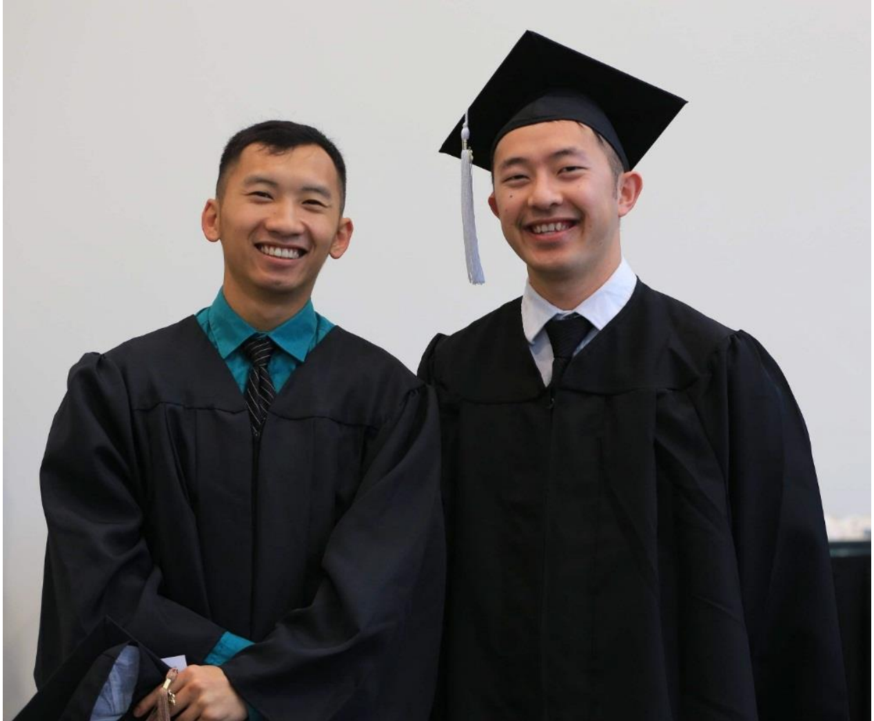
Students from more than 50 countries attend NSU each academic year.