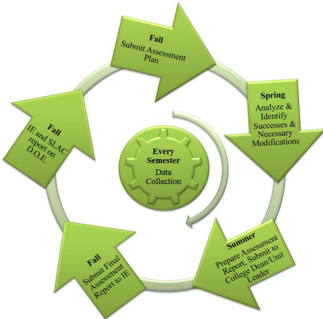
Figure 3. NSU Annual Degrees of Excellence Assessment Cycle

expected results. The committee shares assessment results and develops action plans to the data for improvement.