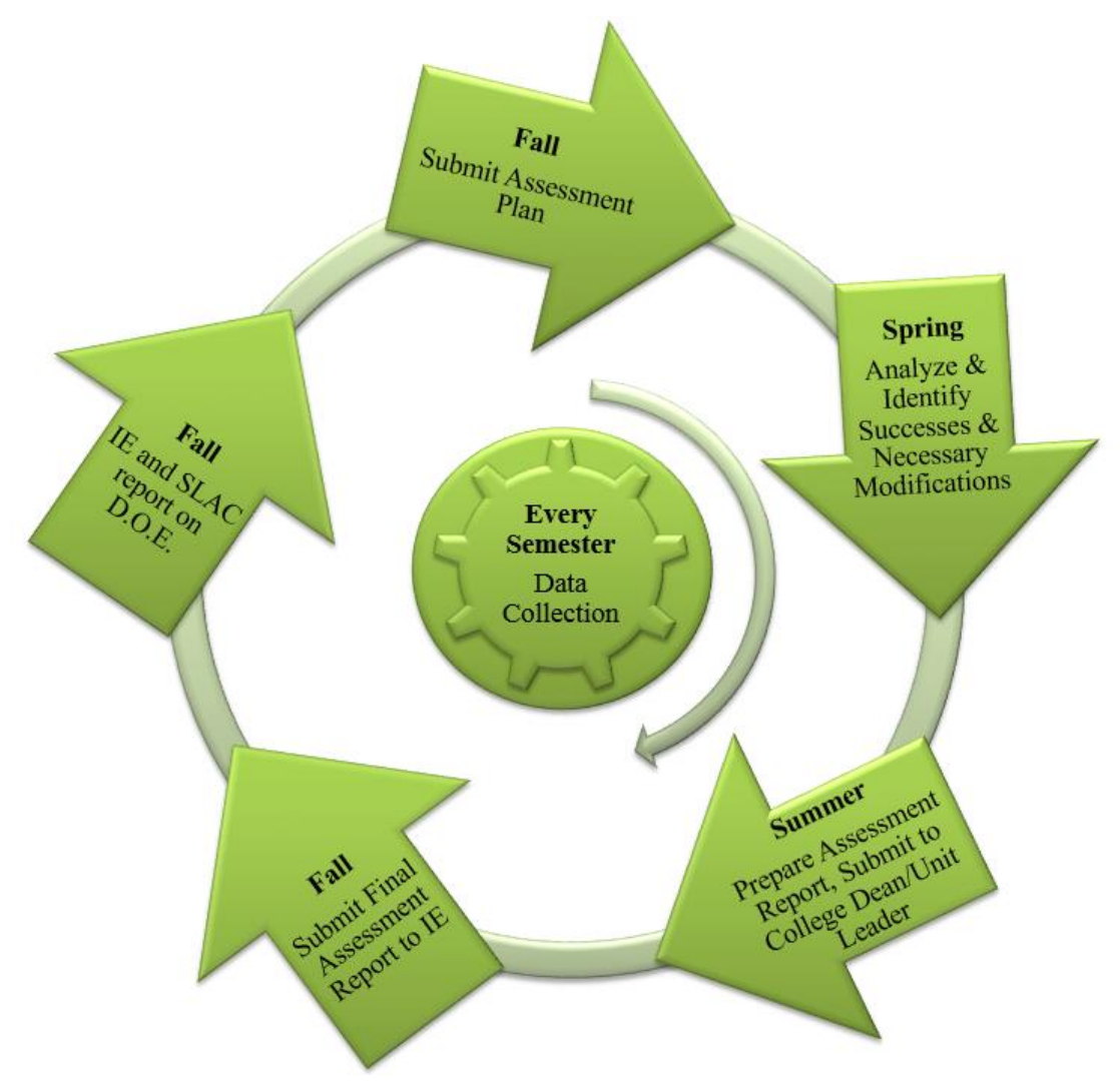
Figure 3. NSU Annual Degrees of Excellence Assessment Cycle

expected results. The committee shares assessment results and develops action plans to the data for improvement.