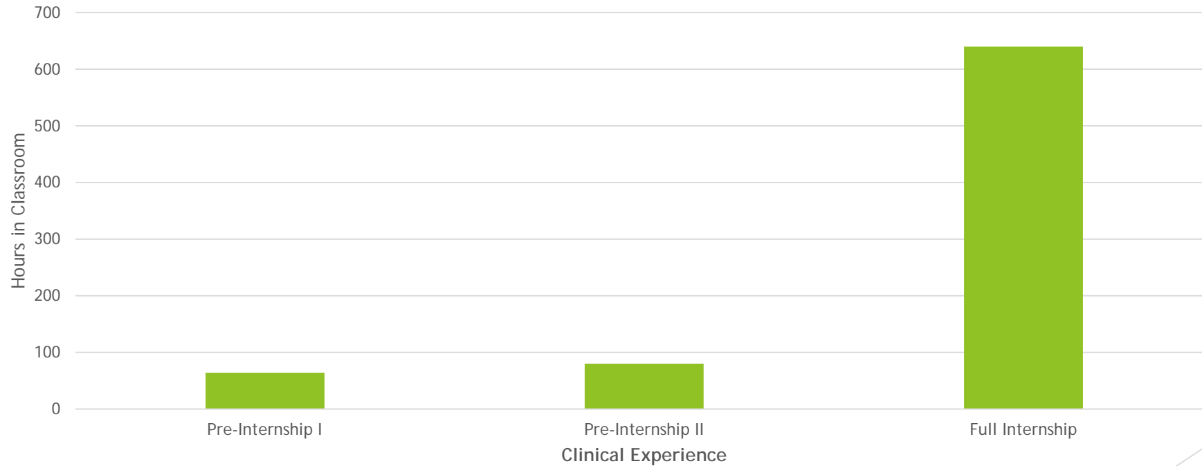
NSU Teacher Candidates' Clinical Hours in Classroom

NSU teacher candidates spend a minimum of 784 clinical hours learning in the classroom alongside experienced teachers. They are required to complete additional hours in their teacher education coursework.