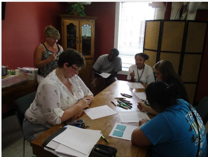
Mentoring program monthly meetings!

Mentoring Program Available for incoming Freshman and Sophomores!